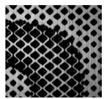
Figure 5 Hybrid effect on tone edges