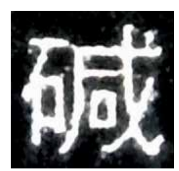
Figure 4 Hybrid Printing